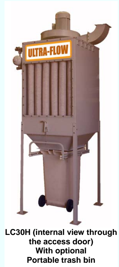
LC30H (internal view through the access door) With optional Portable trash bin

Manufacturing and Suppliers are exclusively USA and Canadian