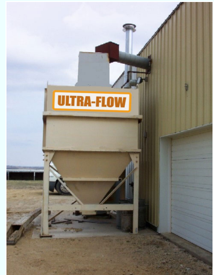
CV412 on welding fumes