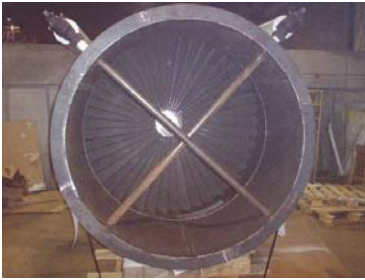
BOOSTER in 64" duct