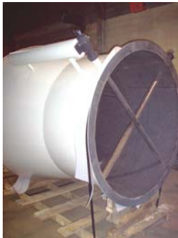
BOOSTER cleans QUENCHER spark arrestor